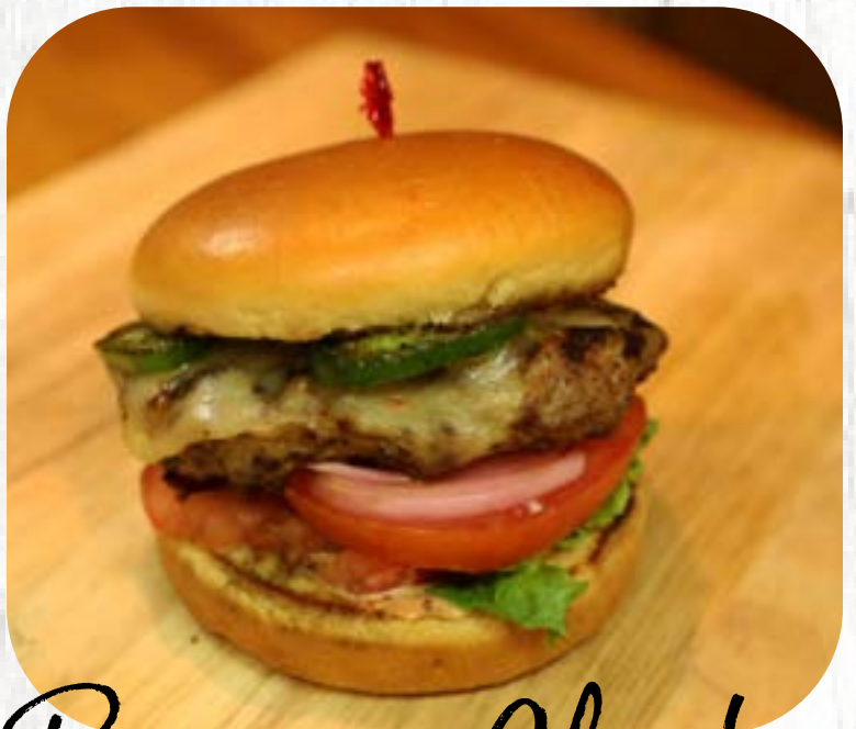
Bonnie & Clyde

House-ground burger patty on a garlic-battered brioche bun with our new Bootlegger Sauce, provolone cheese, mushrooms, roasted red peppers, red onions, and parmesan cheese.